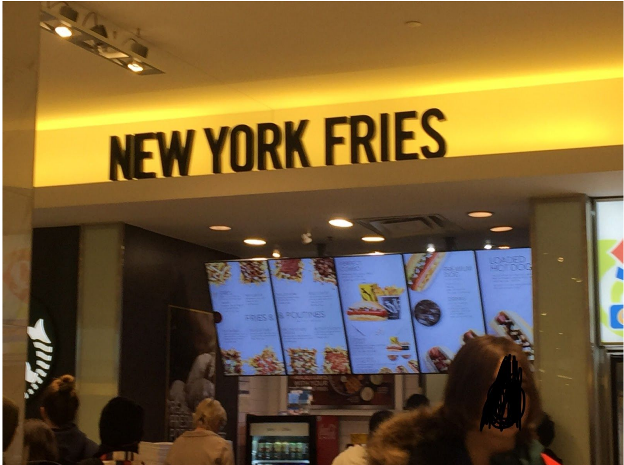
This NYF in Square One is one of the largest consumers of plastic utensils in the mall

Plastic is found too often in food courts!