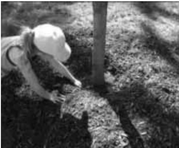
Recommended depth for trees and shrubs: spread mulch no more than 6 inches, or 15cm, deep.