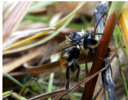
Insect or Arachnid